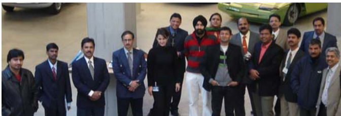
CII Design mission members at a Design Studio in Turin, Italy.