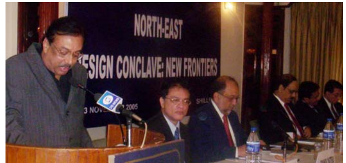
Mr. E V K S Elangovan, Minister of State for Commerce & Industry, Government of India inaugurating Design Conclave in Shillong