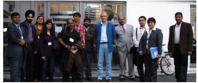
CII Design mission members in UK