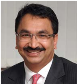
Mr. Vikram Kirloskar Chairman, CII National Committee on Design (2007-08)