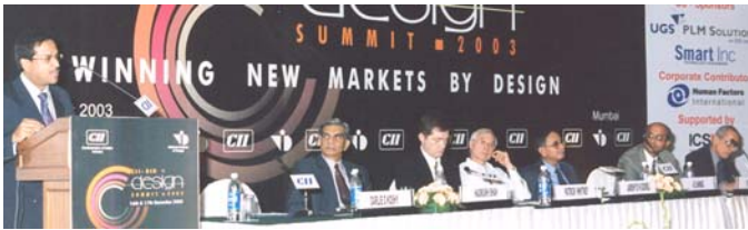
Design Summit 2003